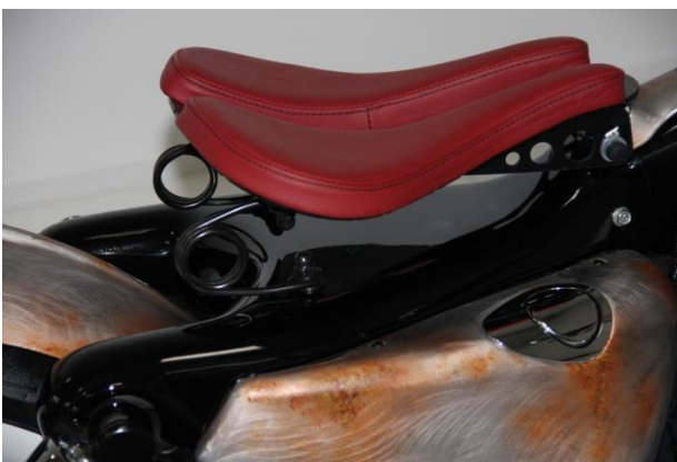
Abb. 1 – mounted frame cover

We recommend using a medium-strength screw lock (e.g. LOCTITE 243, blue) for all screws.