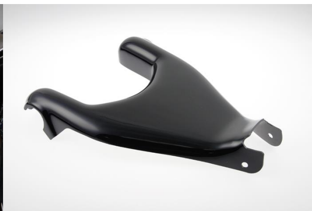
Abb. 2 – Frame cover long