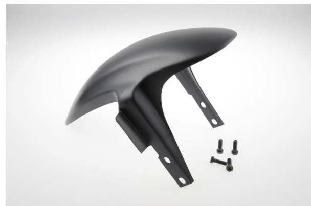
Abb. 2 – front fender "Custom"