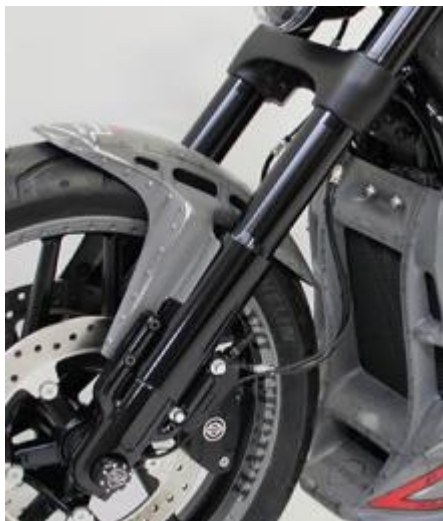
Abb. 1 - Mounted front fender

We recommend using a medium-strength screw lock (e.g. LOCTITE 243, blue) for all screws.