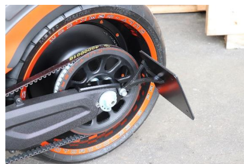
Abb. 4: installed licence plate holder

We recommend the use of a medium-strength screw lock (e.g. LOCTITE 243, blue).