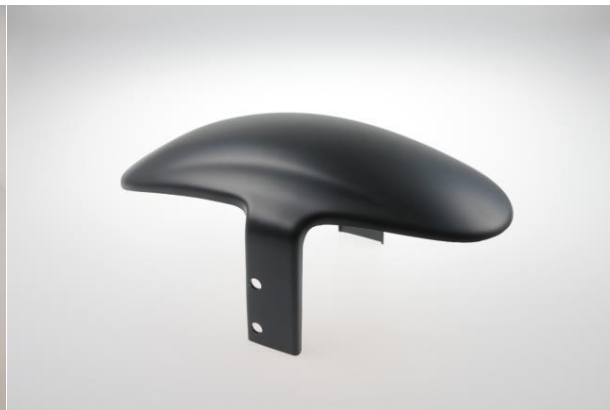
Abb. 2 - Front fender "Custom" V1