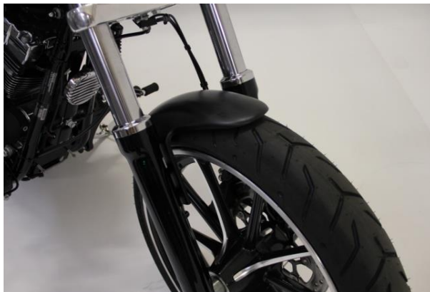
Abb. 1 - Mounted front fender

We recommend using a medium-strength screw lock (e.g. LOCTITE 243, blue) for all screws.