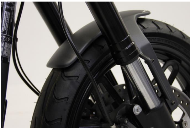
Abb.: 1 – Frontfender montiert

We recommend using a medium-strength screw lock (e.g. LOCTITE 243, blue) for all screws.