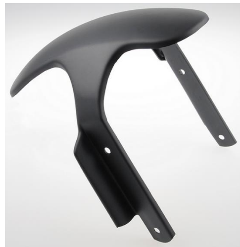
Abb.: 2 - Frontfender Roadster