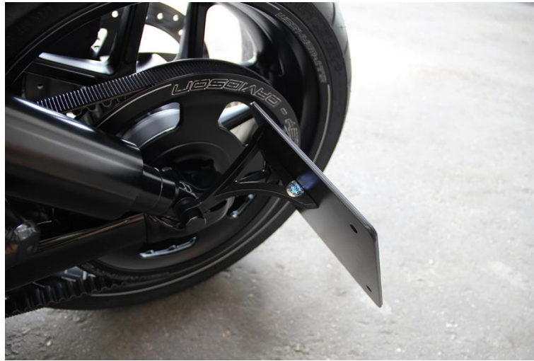
Abb.2 mounted number plate holder