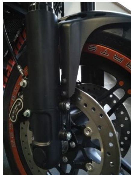
Abb.3 – montierter Frontfender „Custom“