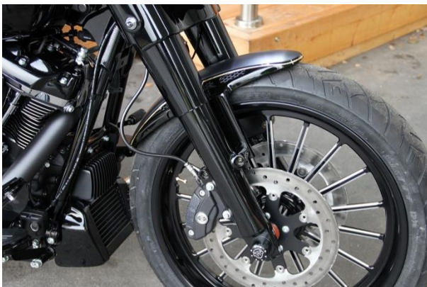
Abb. 1 - mounted front fender

We recommend using a medium-strength screw lock (e.g. LOCTITE 243, blue) for all screws.