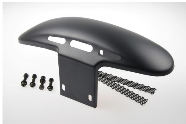
Abb. 2 – front fender "Custom" V2